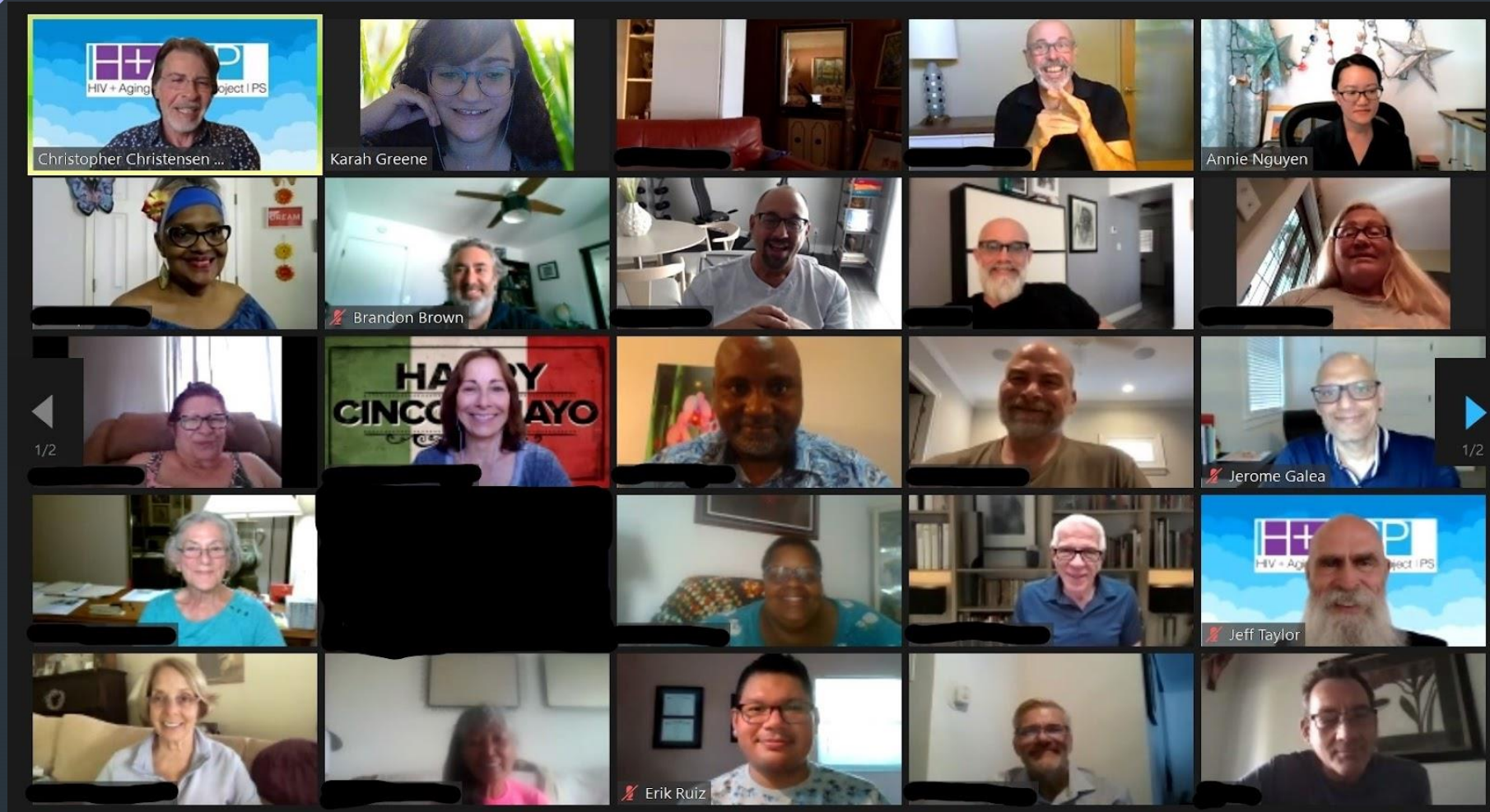
Community Advisory Board Member Screenshot CAB Meeting #3 May 2021